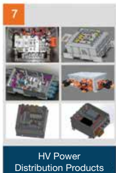
HV Power Distribution Products