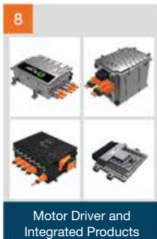
Motor Driver and Integrated Products