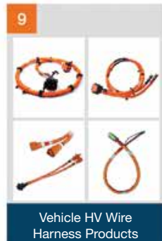
Vehicle HV Wire Harness Products