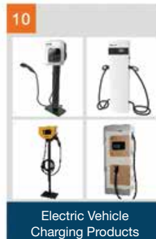
Electric Vehicle Charging Products