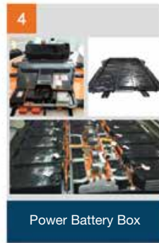
Power Battery Box